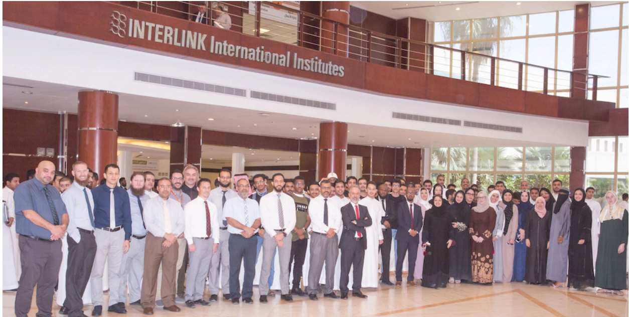
INTERLINK Faculty & Staff at Al Yamamah University